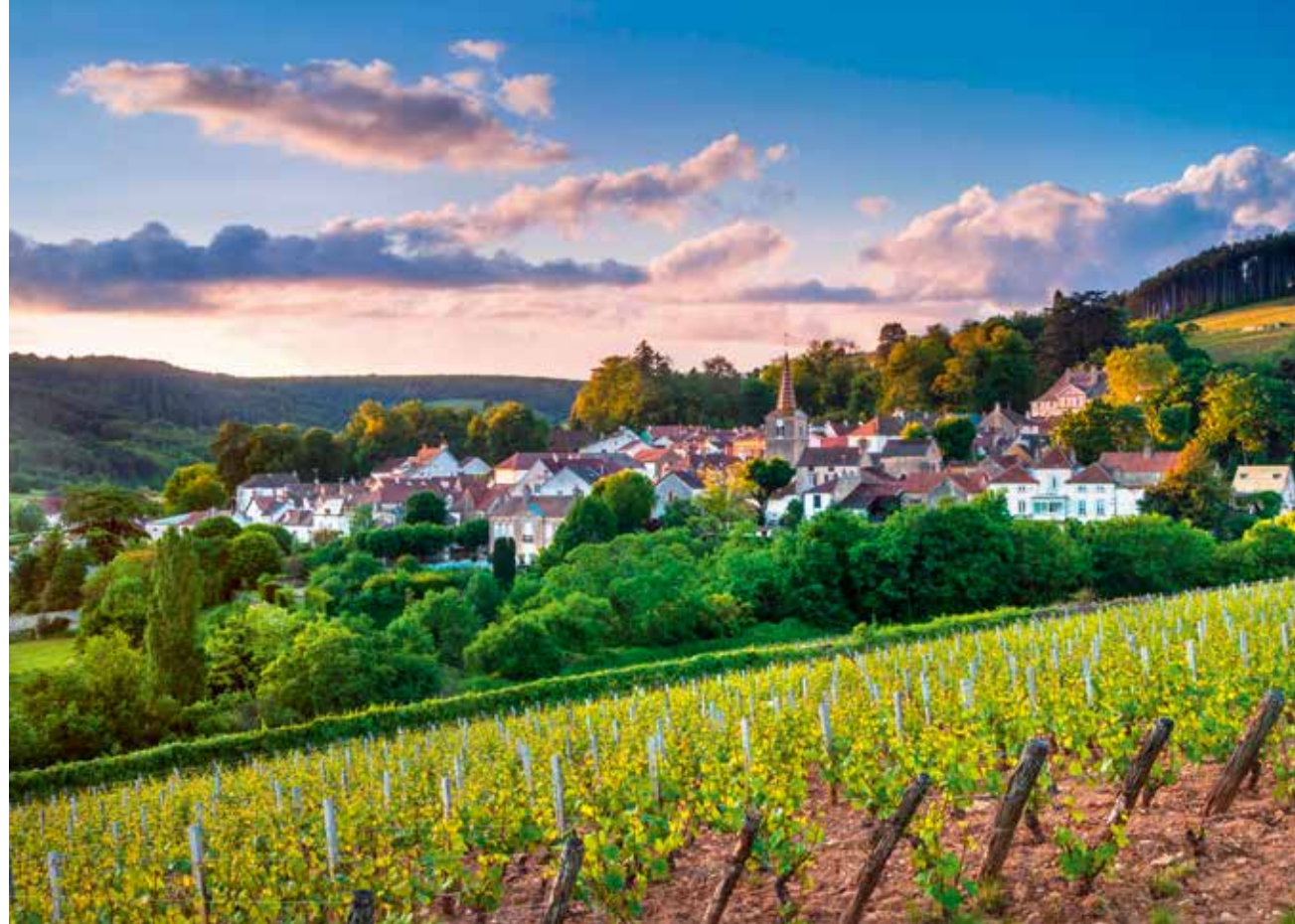
Above: Pernand-Vergelesses, close to the hill of Corton, avoided the serious frosts of April 2019

In the Côte de Nuits, 2019 is a superb vintage. This part of Burgundy avoided the April frost, yet reaped the qualitative benefits of the break on yields imposed by the millerandage that